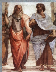
Plato and Aristotle

"The infinite! No other question has ever moved so profoundly the spirit of man." -- David Hilbert (1862-1943)